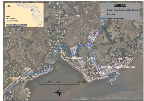
Map of Cedar Key, FL